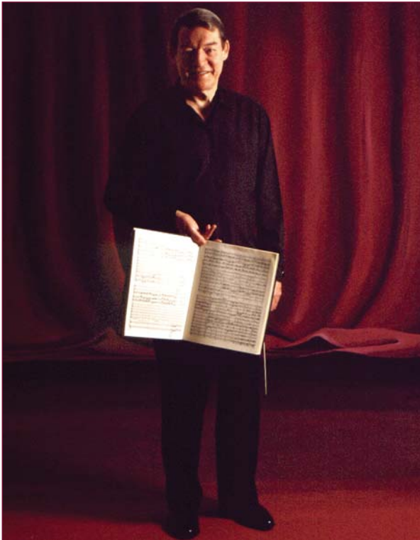
Sir Alexander Gibson, Founder of Scottish Opera

The Alexander Gibson Circle consists of individuals who have a passion for opera and a desire to invest in the artistic excellence for which Scottish Opera is renowned.