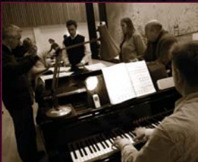
STAGE 3 MUSIC REHEARSAL The Knot Garden