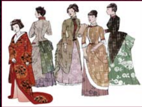
STAGE 1 PLANNING AND DESIGN Costume designs for Madama Butterfly